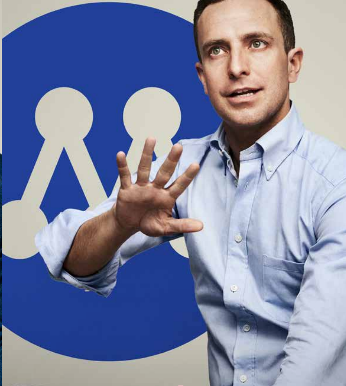
Ulf Kristersson Party Leader

Vote for the Moderates in the EU elections on 26th May